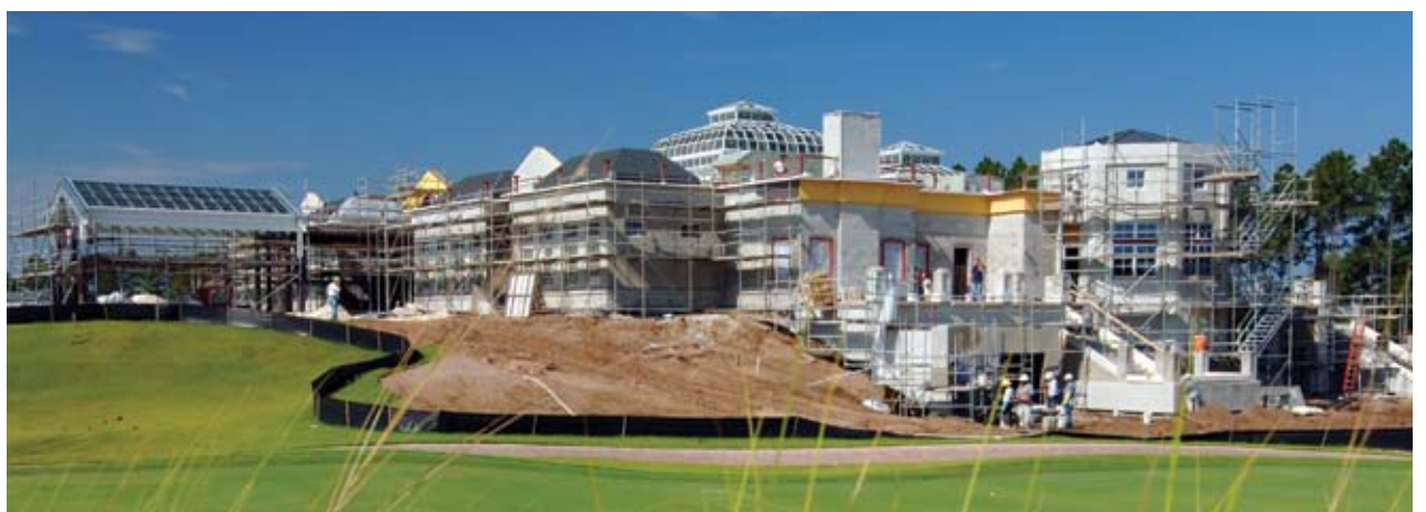
The Clubhouse at the Conservatory will be over 44,000 square feet and feature a custom built glass dome.

At press time, Travertine floors imported from Turkey have been installed on the clubhouse floors,