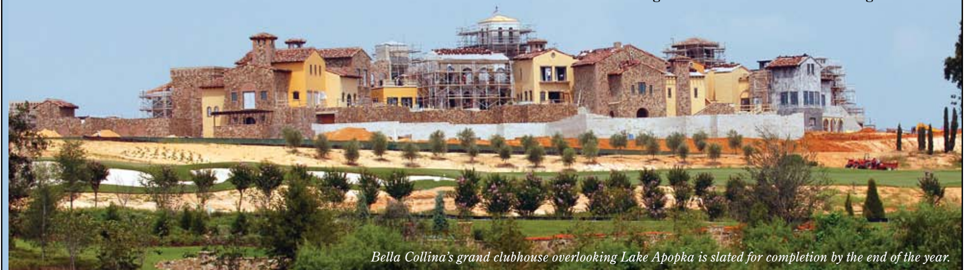
Bella Collina's grand clubhouse overlooking Lake Apopka is slated for completion by the end of the year.

Bella Collina is just minutes from downtown Orlando, on nearly 2,000 acres of live oaks, orange groves and dramatic elevation changes.