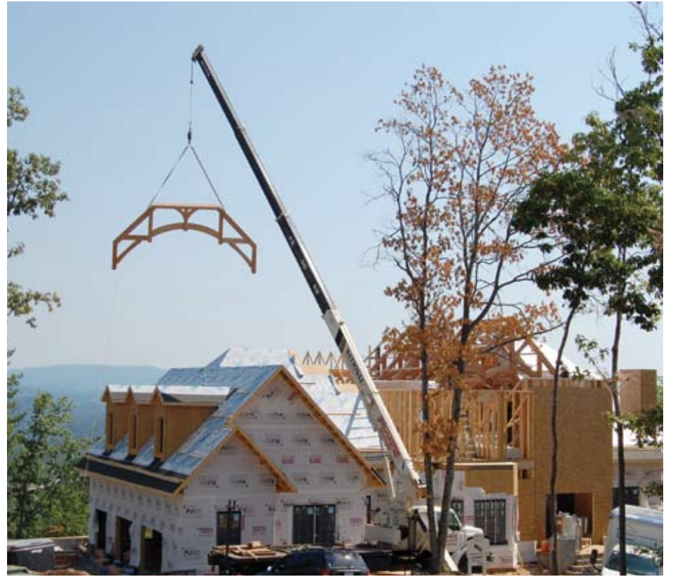
Four model homes at Ginn Laurelmor are currently under construction.