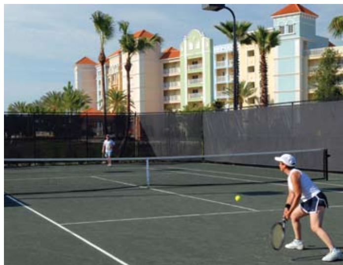
The tennis courts and the pool are just two of the many amenities that will enhance living at Yacht Harbor Village.

"There's just something about being on the Intracoastal Waterway,"