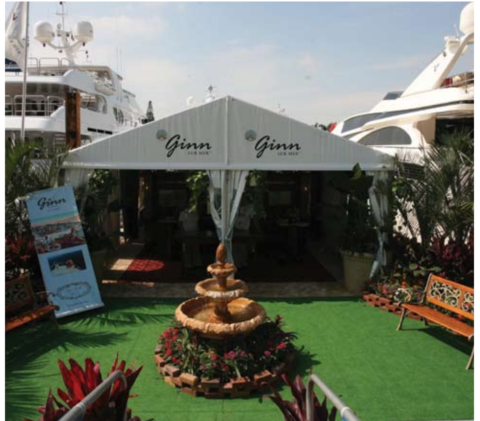
The Fort Lauderdale International Boat Show is the world's premier venue for superyachts and it is the second year for Ginn sur Mer as title sponsor.

The show runs from Thursday through Monday Oct. 24-29 and