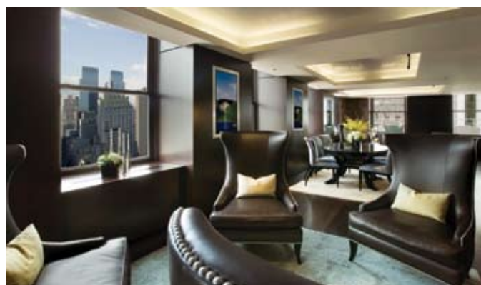
The IMI Club offers stunning views of Central Park.

Gazing out the window from the 34th or 35th floor you can see the park like you can from no other location and just outside the doors of the building are recognizable landmarks such as Tiffany's, The Plaza, Trump Tower,