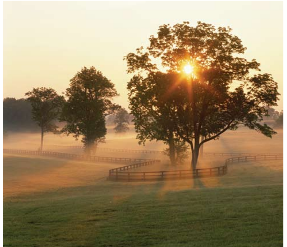
The 1,879-acre BriarRose community is located in Georgia's Oconee River Valley.

Upon completion, the BriarRose is planned to have significant amenities situated in a spectacular natural setting with all the services