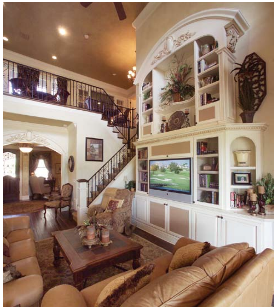
Because Continental, Inc. also owns its trim, cabinetry and interior design company, it can offer unique detailing.