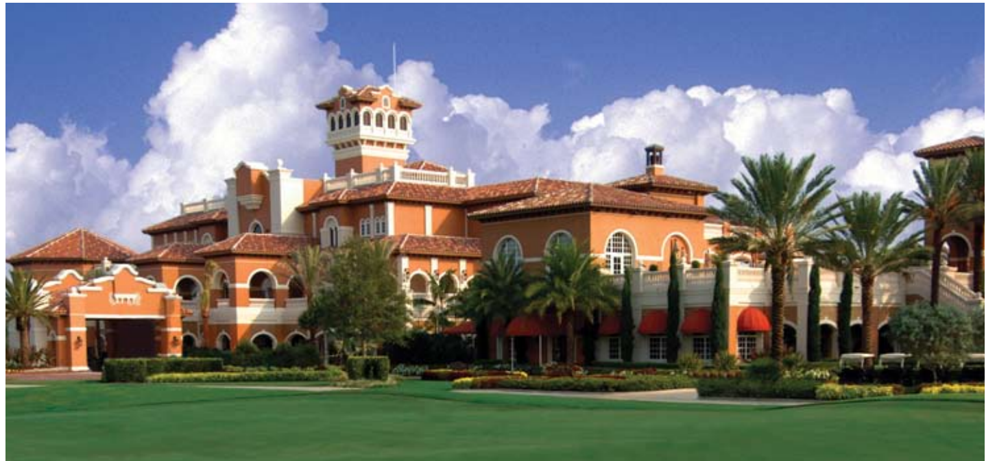
The finishing touches are being put on the Grande Clubhouse as Tesoro readies for its first PGA TOUR event to be held October 22-28.