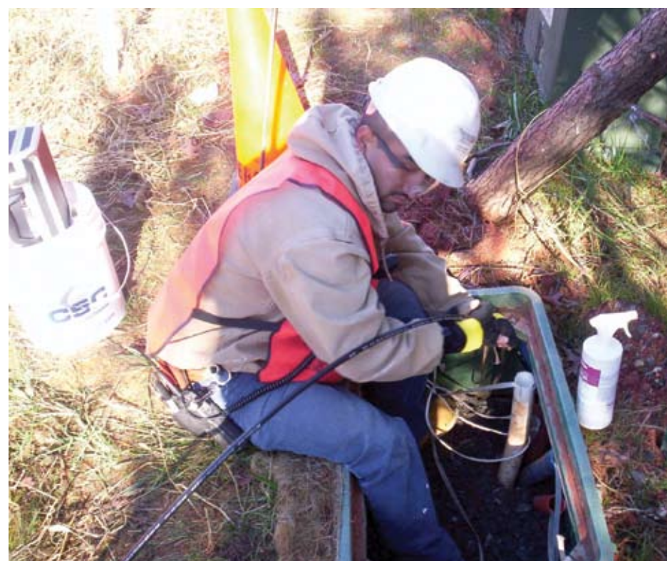
The fiber cable installed by Connexion (seen here in the long black cord) will allow owners and guests to receive telephone, Internet, television and security services bundled over a single fiber network.

Cobblestone Park is similar to Laurelmor in that progress will be dictated by how quickly the electric company can move because that is also a joint trench project. Currently there is approximately 11,000 feet of conduit in the ground and shortly after power has been established, the fiber will be ready.